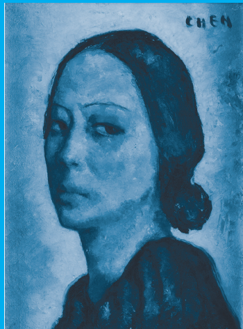
Georgette Chen, Self Portrait, c. 1934. Oil on canvas, 35 x 27 cm. Gift of Lee Foundation. Collection of National Gallery Singapore

Uncover the fascinating story of Georgette Chen (1906-1993), a key figure in the development of modern art in Singapore. The first major museum retrospective of the artist in more than 20 years, Georgette Chen: At Home in the World will feature her most significant works alongside a wealth of newly discovered archival materials.