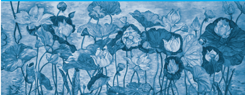
Georgette Chen, Lotus Symphony, 1962. Oil on canvas, 55 x 144 cm. Collection of Long Museum

Georgette Chen: At Home in the World Opens 27 November | City Hall Wing, Level 4 Gallery and Wu Guanzhong Gallery